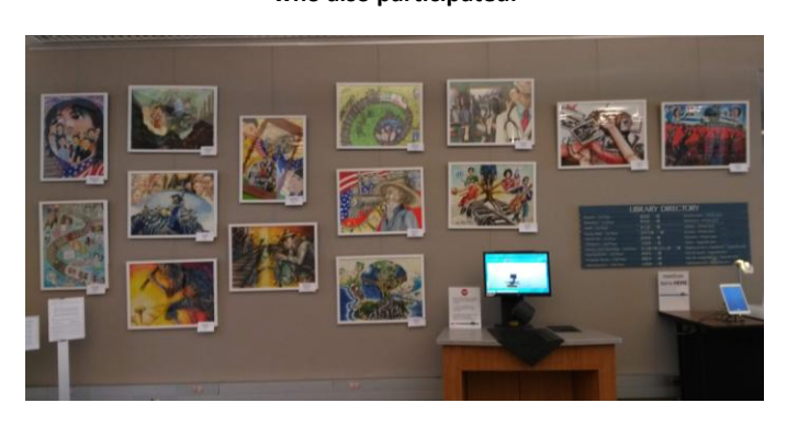
Winning Artworks on Display in Monterey Park Library

In lieu of the National Convention in Boston, the July Lodge Meeting is canceled. Our next Lodge meeting will be in NYC Seafood Restaurant, 715 W. Garvey Ave. Monterey Park on August 12.